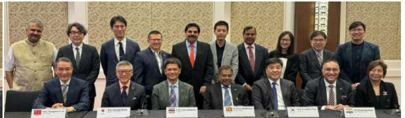
Exec Board with Committee Chairs & FIGO Trustee for Asia Oceania at APM