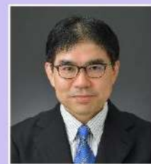
Message from JOGR