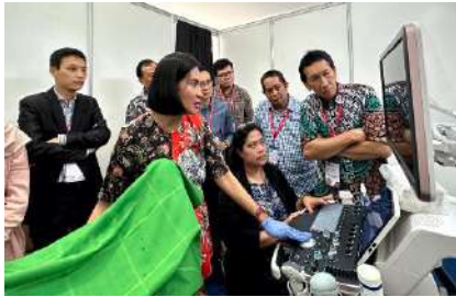
Ultra Sound Committee